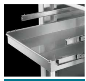
1 HTS shelf with telescopic rails included!

The stable telescopic rails of the Hettich Tray System (HTS) can be extended up to 70% horizontally. This allows you to reach easily the samples in every corner.